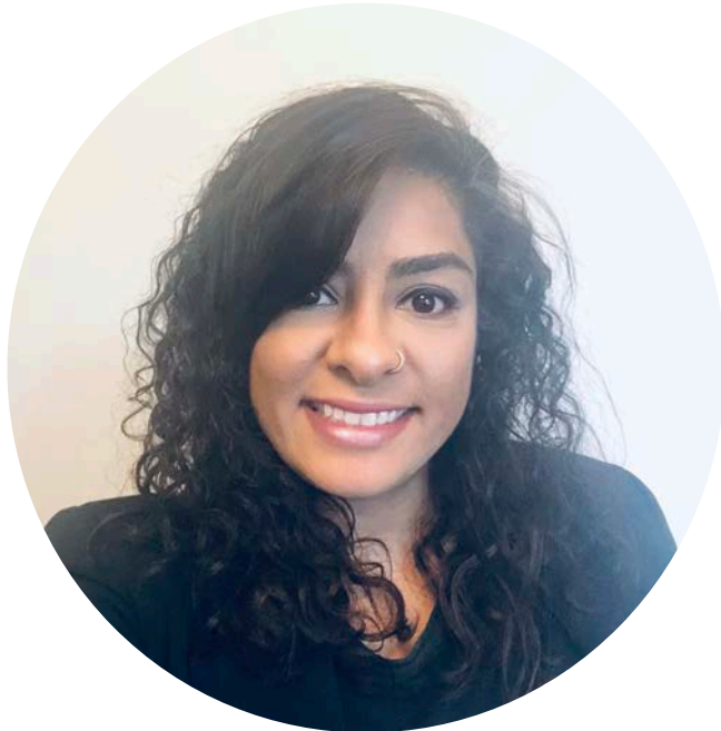
Class RA Teacher & EYFS Lead: