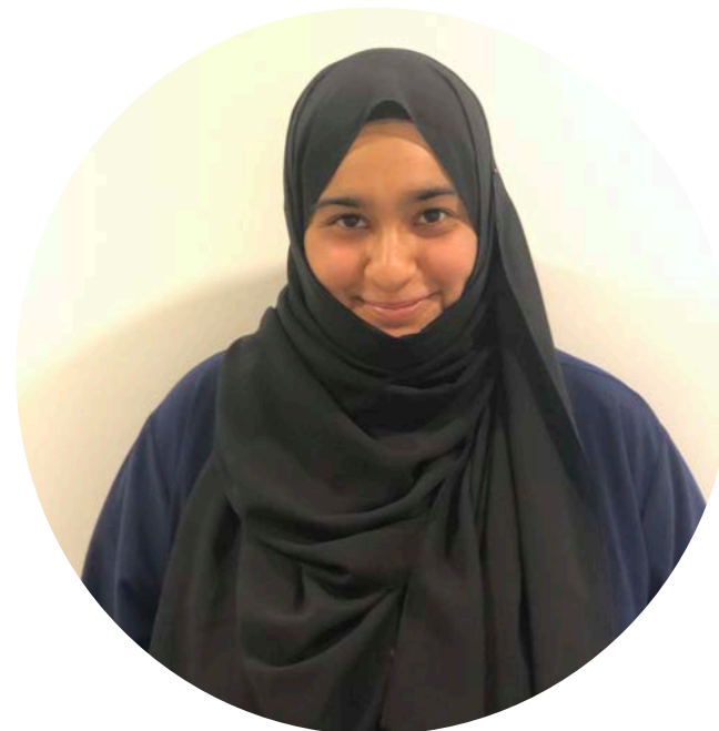
Class RB Teaching Assistant: