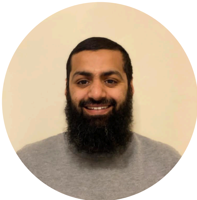
Class RA Teaching Assistant: