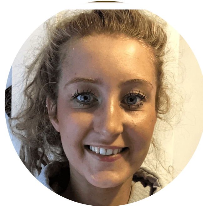
Class RB Teacher: